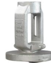
Manual steam carbon steel stop valve