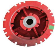
Slurry pump impeller