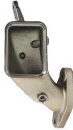
Sensor mounting bracket