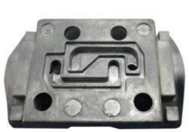
Hydraulic valve cover