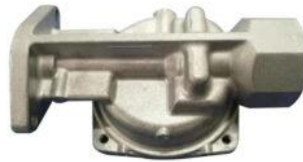
Pressure reducing valve body