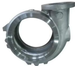
Stainless steel turbine pump housing