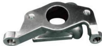
Engine forging rocker arm