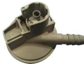
Drain valve assembly