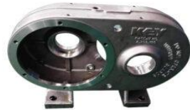
Stainless steel guide shell