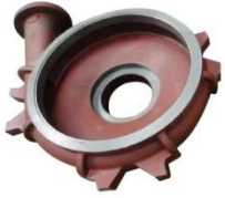
Cast iron pump housing