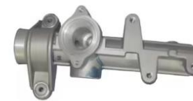
Die Casting Parts