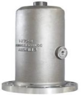
Safety valve bonnet