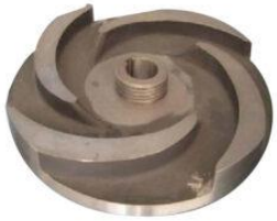
Stainless steel impeller