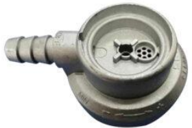
Filter valve parts