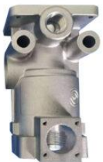
Thermostat housing parts