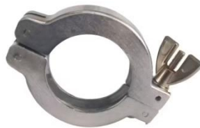
KF40 Aluminium alloy clamp