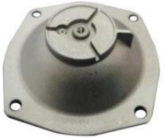
Valve cover parts