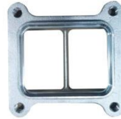
Intake manifold gasket