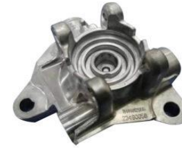
Booster pump body