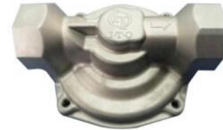
Check valve body