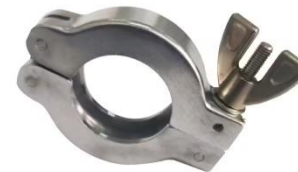
KF16 Aluminium alloy clamp