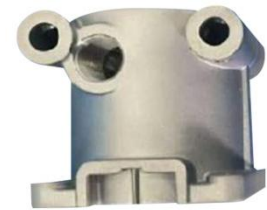
Coolant control valve components