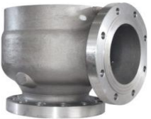
Safety valve body