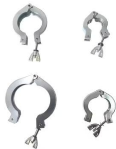
KF16/25/40/50 Aluminium Alloy Clamp