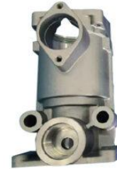
Fuel system valve housing