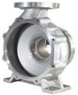
Chemical pumps body