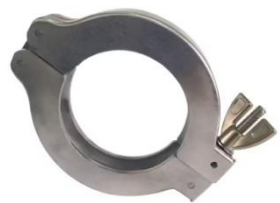
KF50 Aluminium alloy clamp