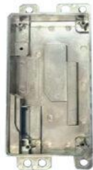
Valve housing parts