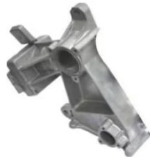
Power Steering Pump