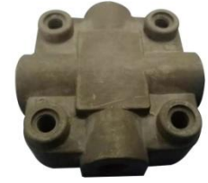
Airbag regulating valve body