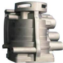
Multi-way valve components