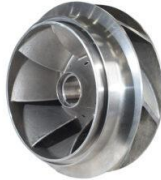
Centrifugal pump impeller