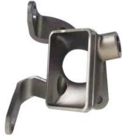
Fixing bracket parts