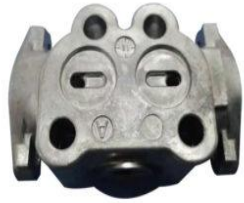
Valve cover gasket bracket