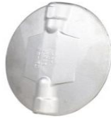
Butterfly valve parts