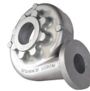
Centrifugal pump casing