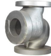
Automatic pressure control regulating valve body