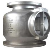
Flange vertical automatic check valve body