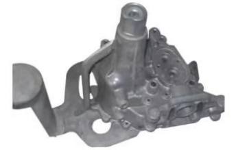
Engine oil pump