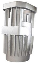
Pipeline pump motor housing