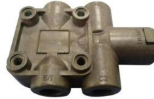
Brake valve parts