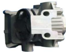
Electronic throttle valve body