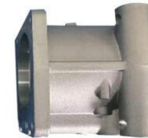
EGR valve housing