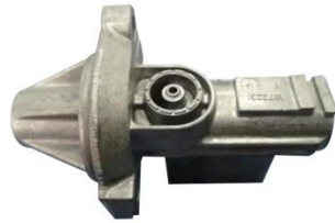
Suppression valve body